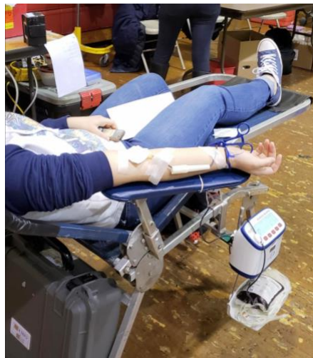
Student donating blood @ Hubbard High School