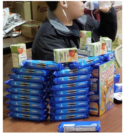
Sugar station for students that donated blood

When we arrived to the school, an ROTC officer escorted us to the blood drive. There were loads of students waiting to participate. They had a registration table and seating area. Beyond that point they had another waiting area for students to be called to take the questionnaire to find out if they were eligible to donate. If not, they could go back to class. If they were good candidates, they went on to the blood drawing area where they were greeted by the nurses and technicians who would draw their blood. Once they donated, they would rest to make sure they were able to move on to the next section. The next and final section was the sugar station. There were cookies, juice, etc. The students finished their goodies and then returned to class.