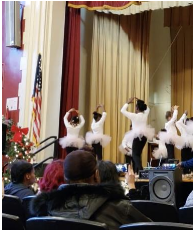
Barton students performing ballet and singing Christmas songs